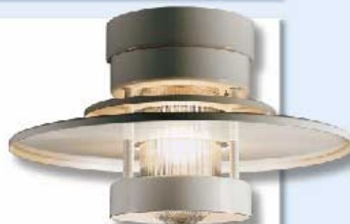
HL333XL 18" Dia, 11-1/4" H

Please ADD desired Diffuser, Finish and Light Source codes to catalog number when ordering. Example: HL333XL SE WH -M50/R