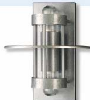
HL317 18" W, 21" H, 12-3/4" E, 10-1/2" Mtg.Ctr.

Note: Optional rain deflector required on upper diffuser for outdoor applications. Please add suffix "RD" to catalog number to order.