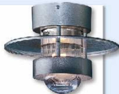
HL333 10" Dia, 7-1/2" H

Please ADD desired Diffuser, Finish and Light Source codes to catalog number when ordering. Example: HL333 CPR FS (Incandescent - no Light Source code required)