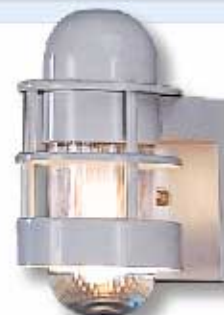
HL335 5-1/4" W, 10" H, 7" E, 6-1/4" Mtg.Ctr.

Please ADD desired Diffuser, Finish and Light Source codes to catalog number when ordering. Example: HL335 CPR WH -22Q